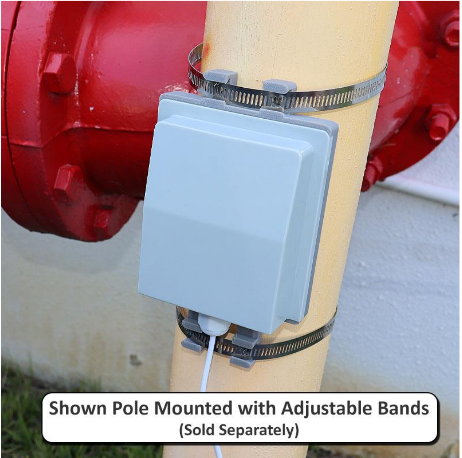
Shown Pole Mounted with Adjustable Bands (Sold Separately)