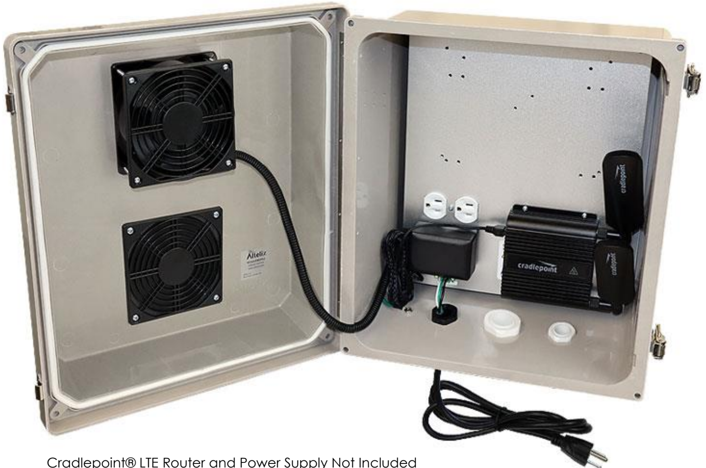
Cradlepoint® LTE Router and Power Supply Not Included

Altelix Weatherproof Enclosure with Cooling Fan, 120VAC Outlets and Power Cord for Cradlepoint® R500-PLTE, IBR600 and IBR900 Series LTE Routers