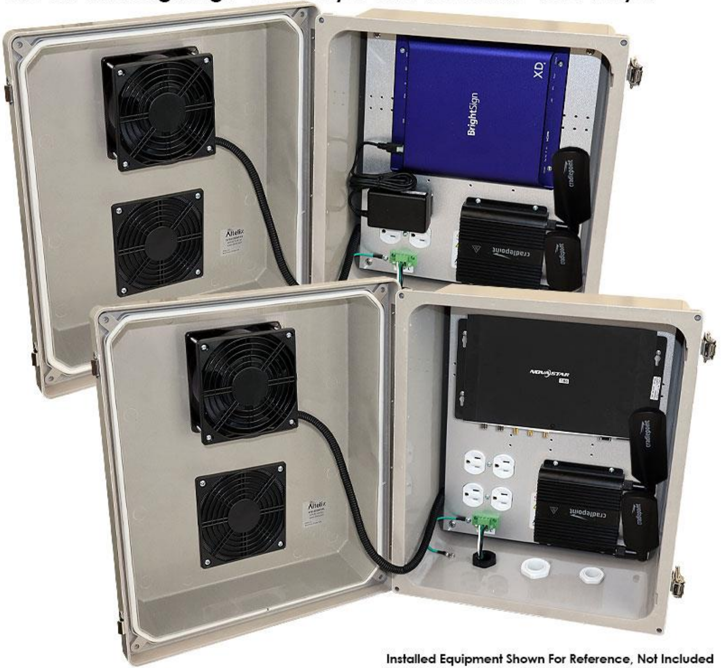
Installed Equipment Shown For Reference, Not Included