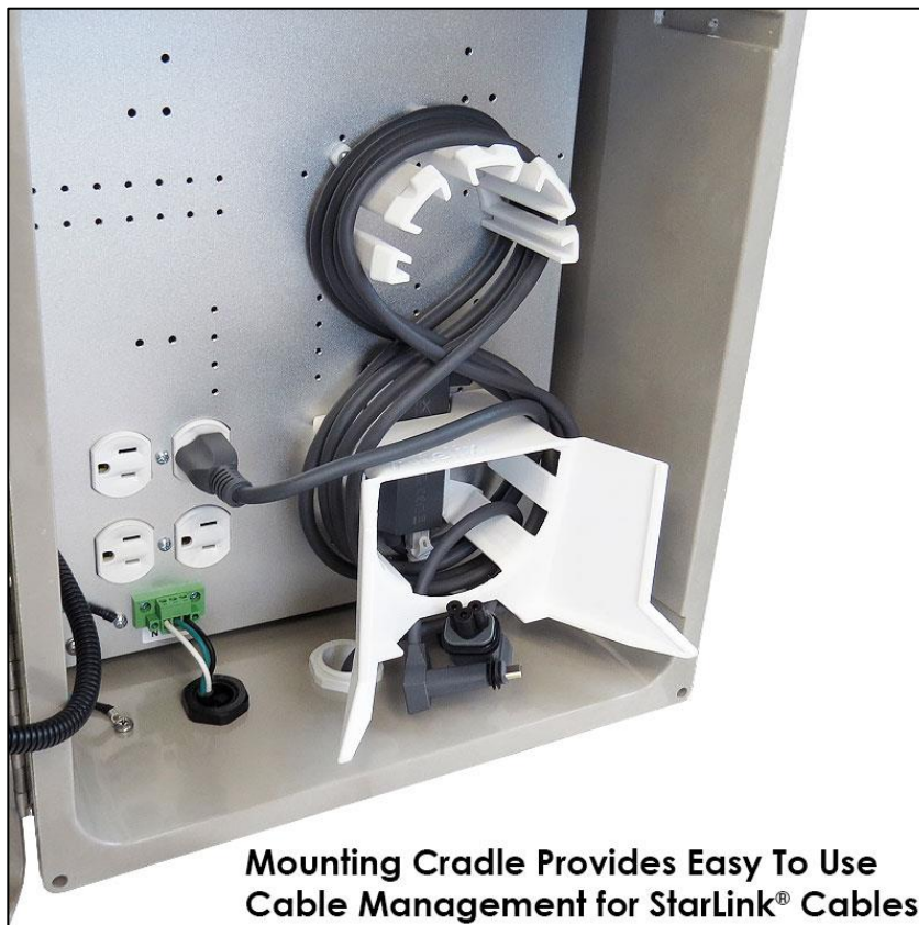
Mounting Cradle Provides Easy To Use Cable Management for StarLink® Cables