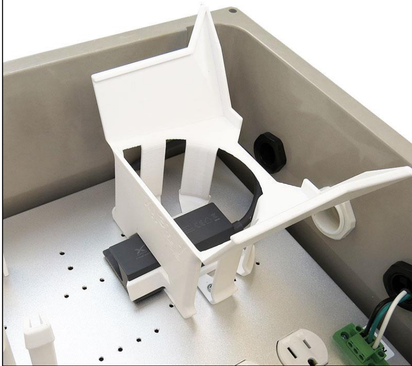
Multi Function Mounting Cradle Provides Slot To Mount the Starlink® Ethernet Adapter