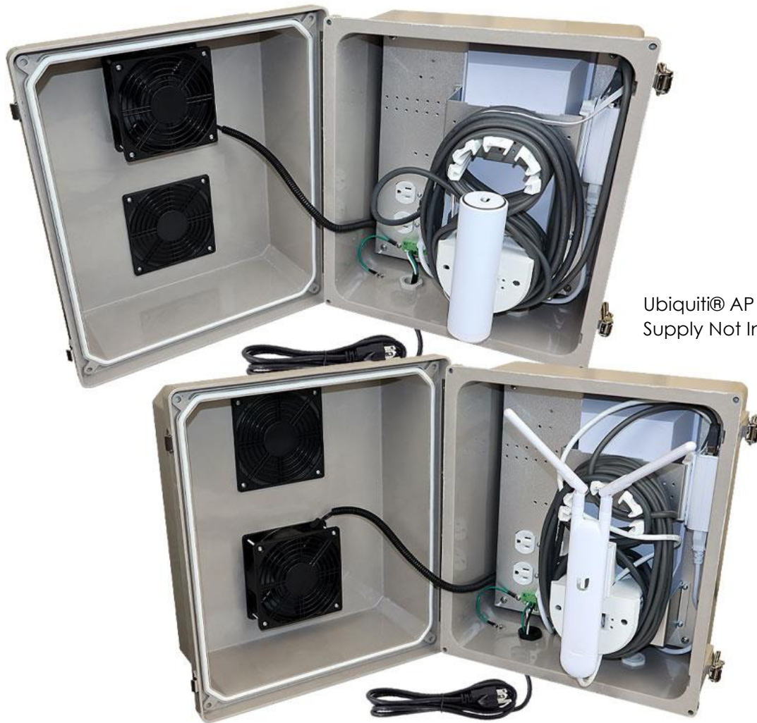
Ubiquiti® AP & Starlink® Power Supply Not Included