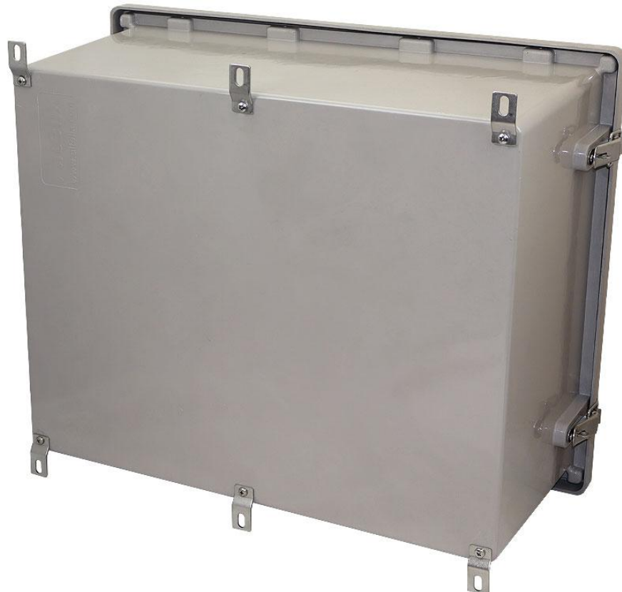
Shown with mounting brackets installed.

Altelix LLC USA: 866-660-9434 +1 561-660-9434 sales@altelix.com www.altelix.com