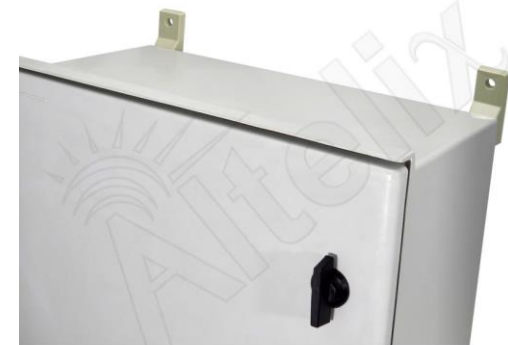
Wall Mounting Feet, (4) Included with Enclosure