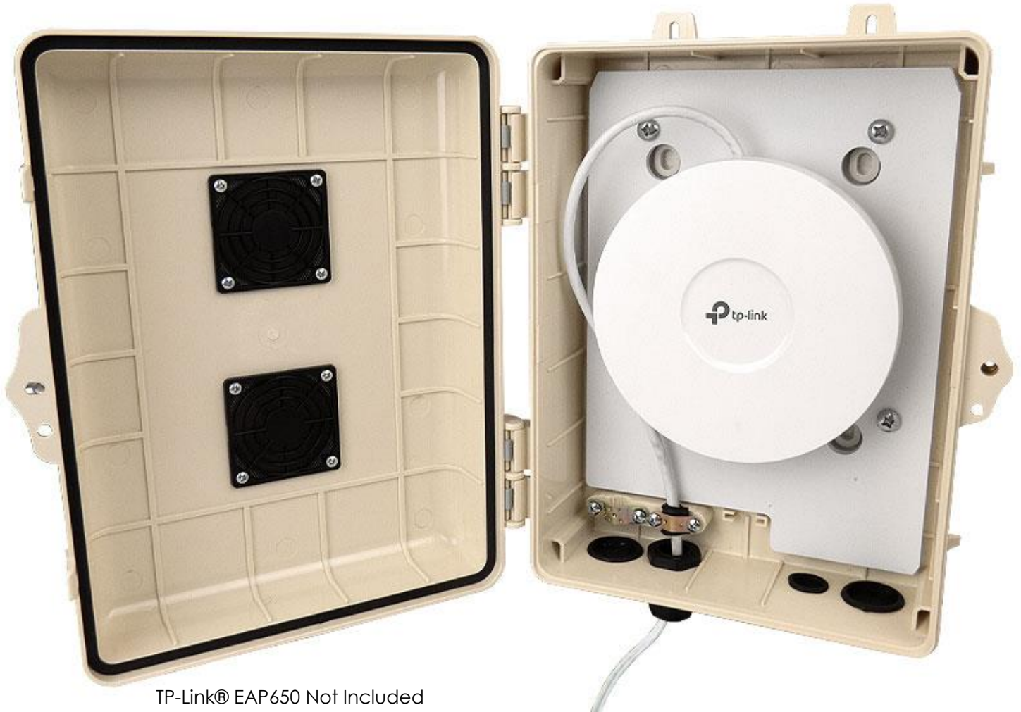
TP-Link® EAP650 Not Included