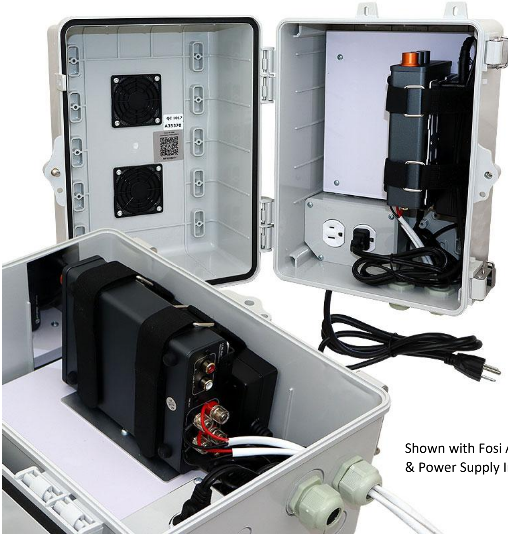
Shown with Fosi Audio® BT20A Pro Amplifier & Power Supply Installed – Not Included