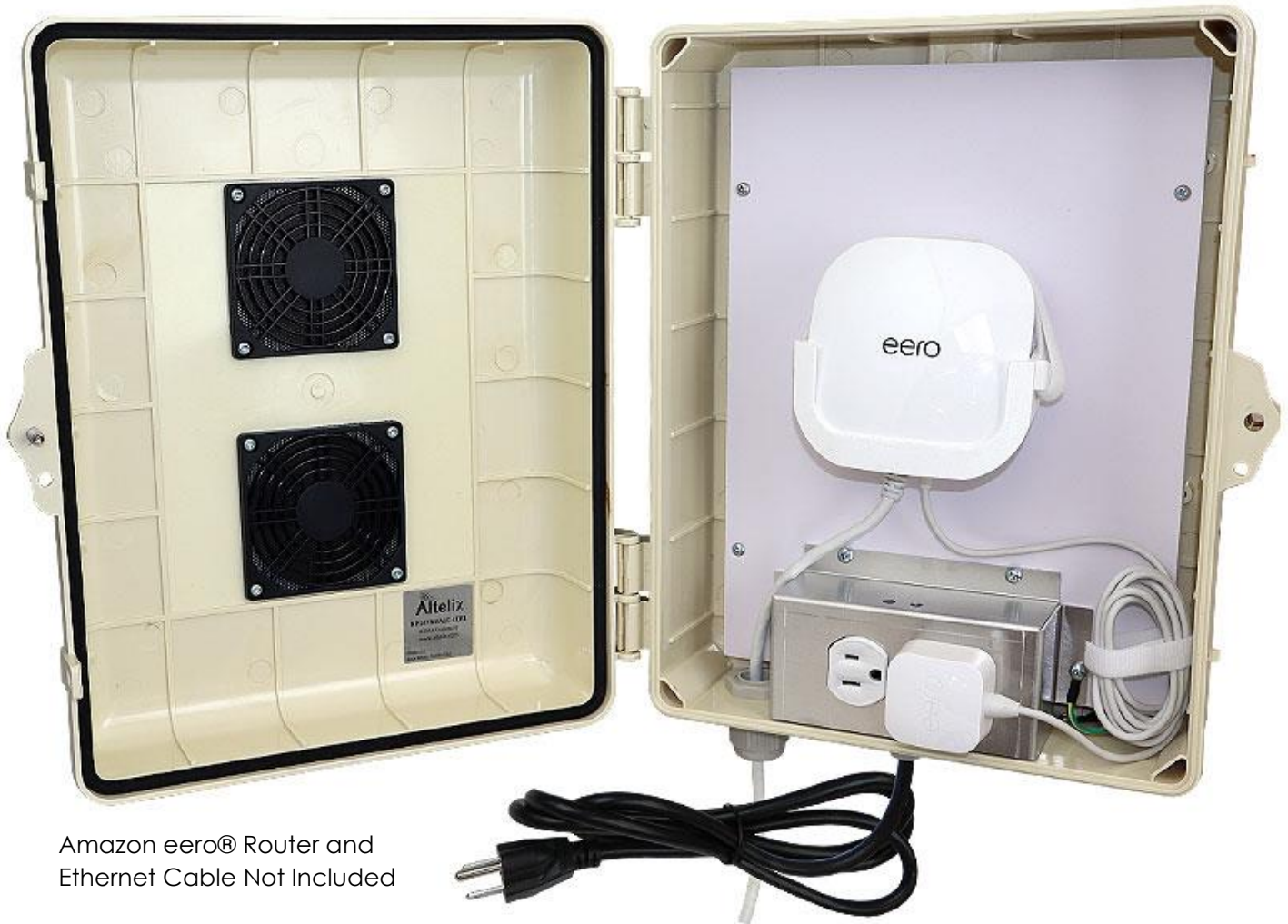
Amazon eero® Router and Ethernet Cable Not Included

Altelix Vented Weatherproof Enclosure for Amazon eero® 2 nd Gen Mesh WiFi Router with 120VAC Outlet and Power Cord