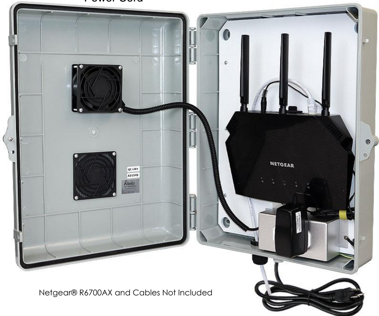
Netgear® R6700AX and Cables Not Included

Altelix Weatherproof Enclosure for Netgear® Nighthawk® R6700AX and RAX10 WiFi Routers with Cooling Fan, 120VAC Outlets and Power Cord