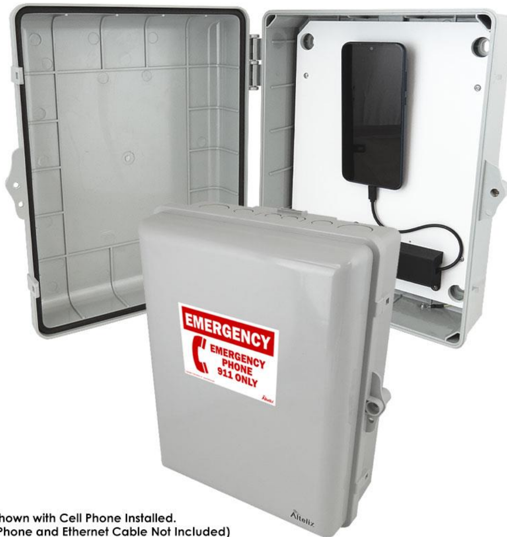
Shown with Cell Phone Installed. (Phone and Ethernet Cable Not Included)