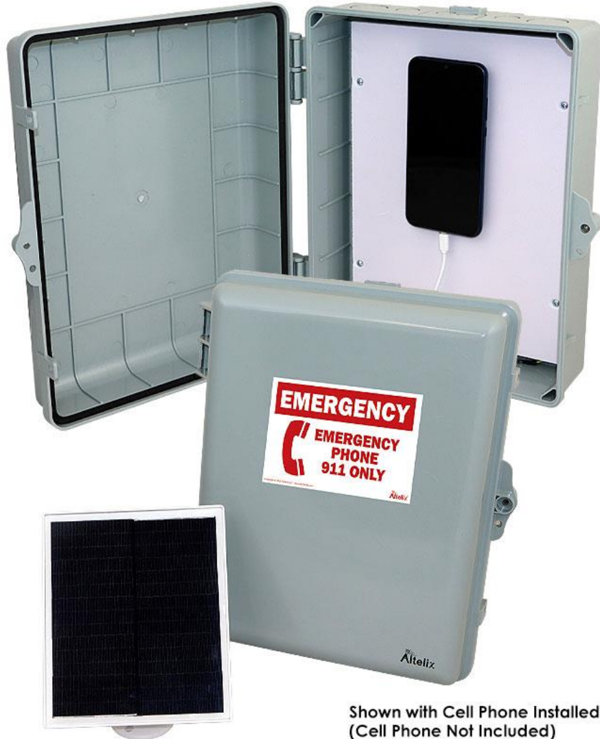
Shown with Cell Phone Installed. (Cell Phone Not Included)