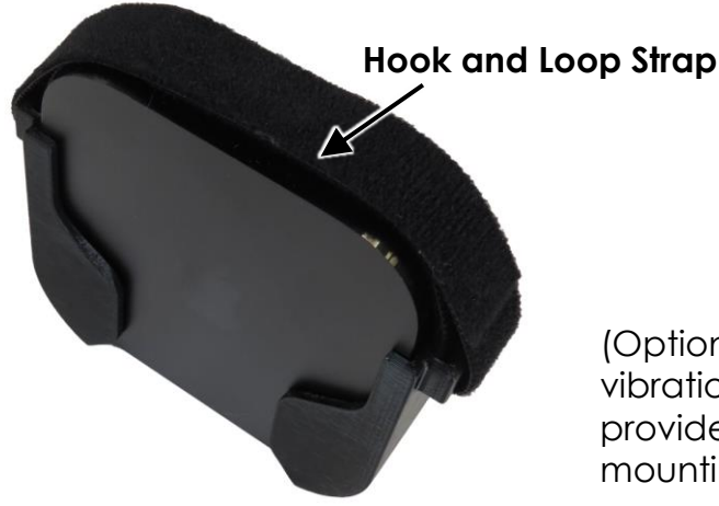
Hook and Loop Strap

Once the BMP-APV1 is mounted, insert the Apple TV into the cradle as shown.