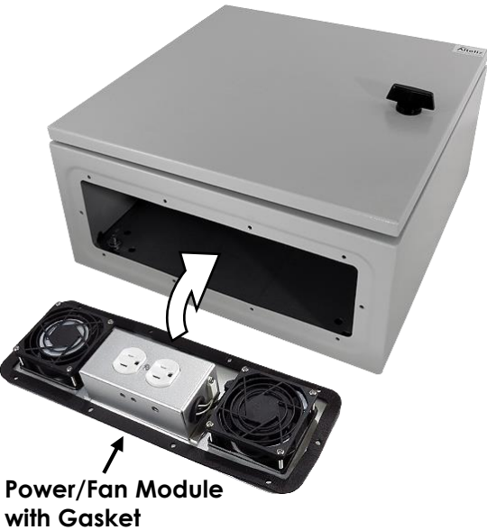
Power/Fan Module with Gasket