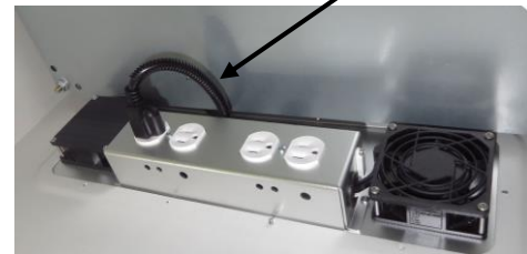
Heating System Power Cord

Once module is installed, plug internal power cord into an open outlet. This supplies power to the internal heating system.