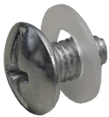
Mounting Screw with Nylon Washer