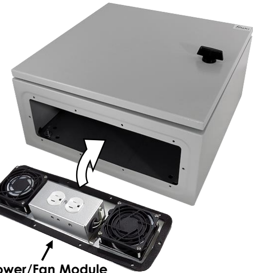
Power/Fan Module with Gasket