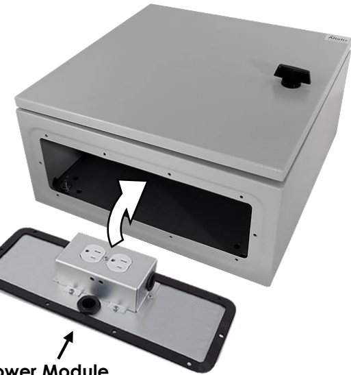
Power Module with Gasket