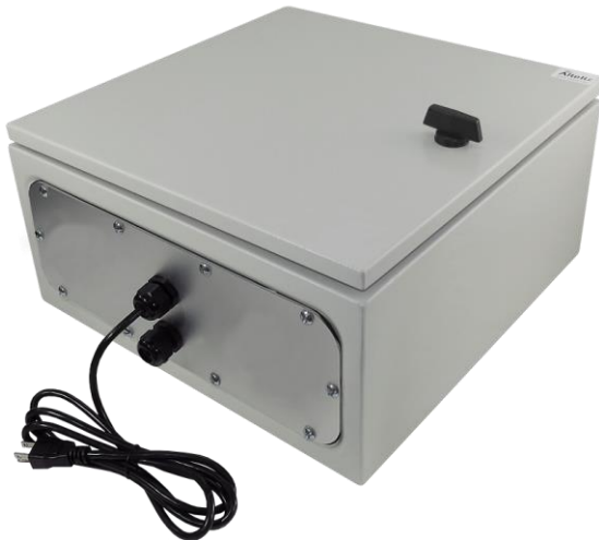
Enclosure with Power Module Installed