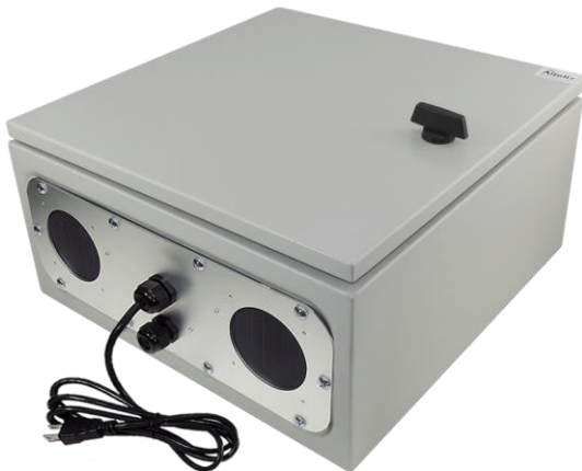
Enclosure with Power/Vent Module Installed