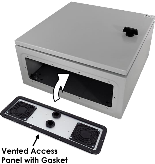
Vented Access Panel with Gasket