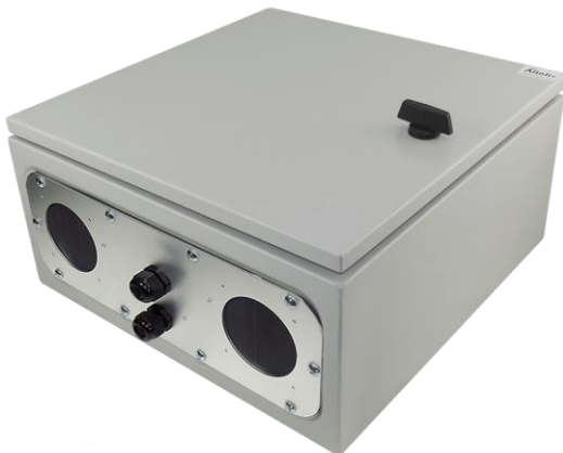
Enclosure with Vented Access Panel Installed